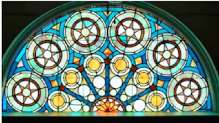
CONGREGATION B'NAI ISRAEL JACKSON, TN