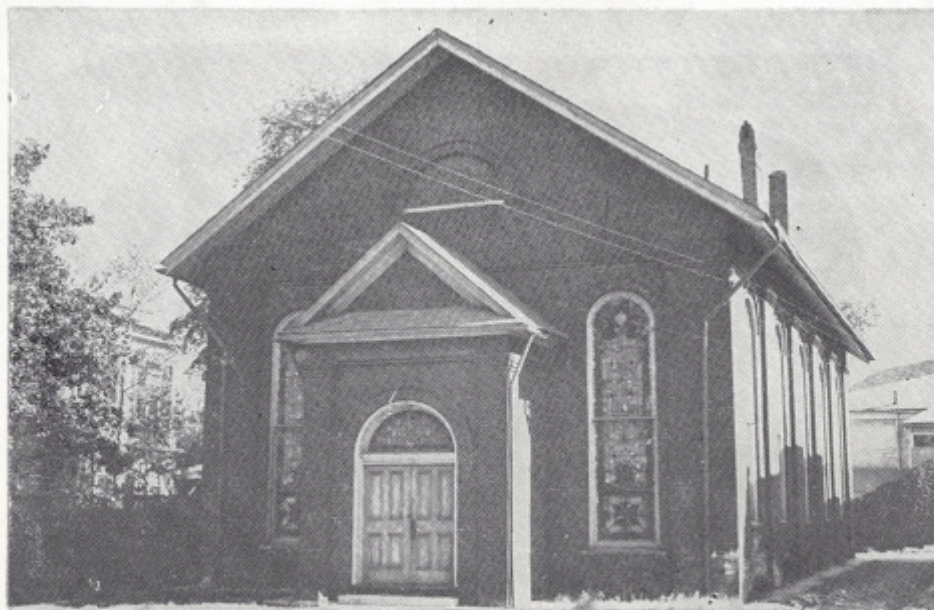
THE OLD TEMPLE—1897-1941