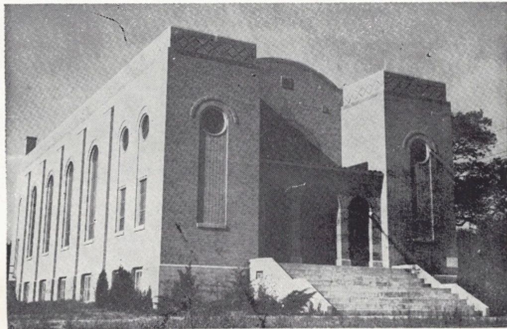
THE NEW TEMPLE—ERECTED AND DEDICATED 1942

This magnificent new Temple, which is now being formally dedicated, is not only a source of warranted satisfaction and pride to the members as well as non-members who gave to it liberally of their material resources, but it also will stand firm throughout the years as an enduring monument to the men and women whose forward-looking vision and consecrated labors made possible its erection. May its sacred walls ever continue to radiate spiritual sustenance and strength into the hearts and lives of the Congregation and the wider community. May it come to fulfill for us and our children the prayerful hope uttered by Solomon of old when the First Temple was dedicated in Jerusalem: "My House shall be called a House of Prayer for all Peoples."